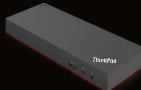
◀ ThinkPad® Thunderbolt™ Workstation Dock