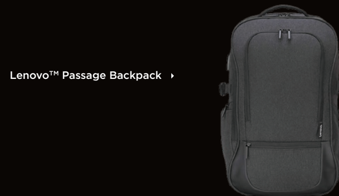
Lenovo™ Passage Backpack ▶