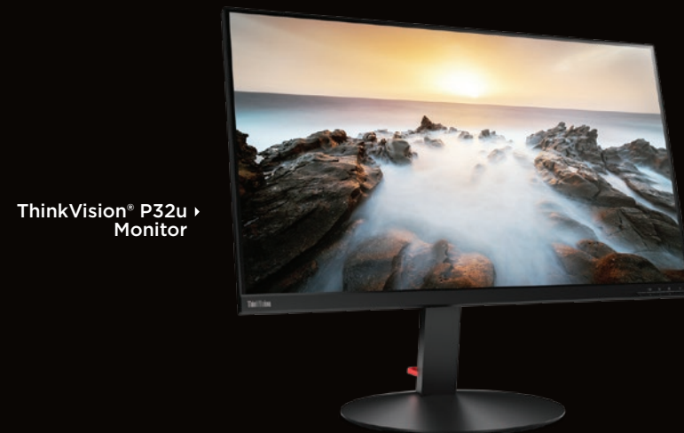
ThinkVision® P32u ▶ Monitor